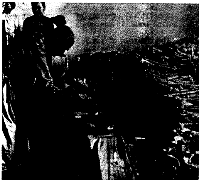
A BUDDHIST ELDER lights incense before the remains of more than 200 people killed near Da Mai Creek, the scene of fierce fighting and B-52 bombing. The U.S. and Saigon governments attributed all the deaths to communist execution.

Pike apparently made no effort to inquire into what in fact did happen in the later period of the communist occupation. Saigon officials in Hue