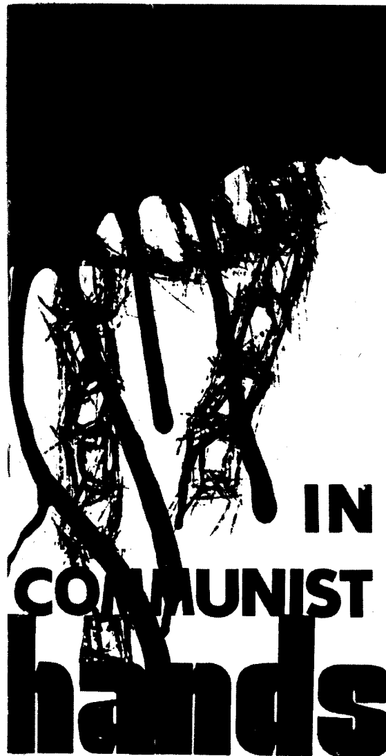
TWO TYPICAL PROPAGANDA LEAFLETS by the Saigon government about the 1968 "Communist massacre" in Hue. Leaflet at left was published by the Saigon Embassy in Washington, D.C. and the one on the right in Saigon by the Popular Mobilization and Chieu Hoi offices.