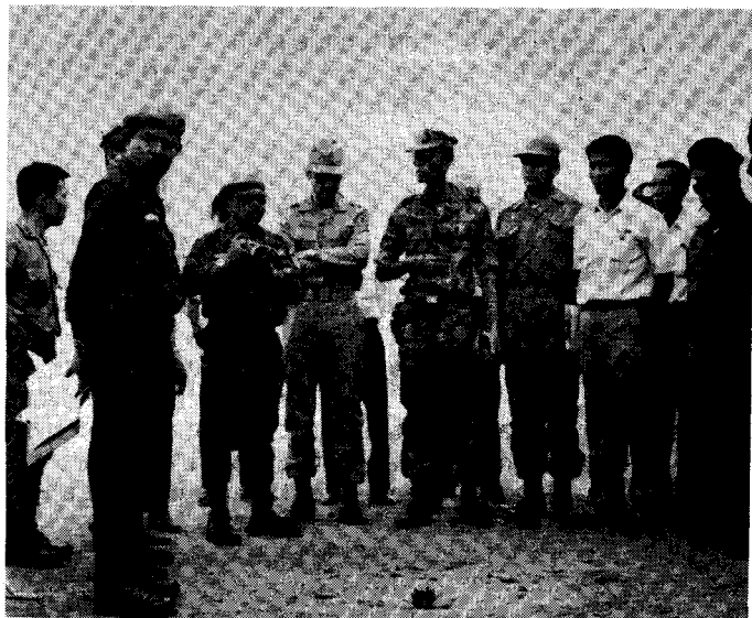
ON GUIDED TOUR OF CAI LAY schoolyard, Iranian and Indonesian ICCS members view tail fin of a Chinese-made 82mm mortar shell which Saigon claims rested precisely "where it landed."

Paris, and to isolate the P.R.G. delegation in Saigon by cutting its telephone lines, shutting off its Saturday morning press conferences, and canceling all liaison flights to Loc Ninh, a P.R.G. administrative center. Also during this wave of the propaganda assault, Mr. Thieu declared that those who style themselves members of the third force are traitors, and that the third force itself is nothing but a creation of the "North Vietnamese Communists."