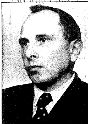
Führer for a day: Stefan Bandera led the OUN's short-lived autonomous fascist state.

Under long-standing U.S. immigration laws, strengthened in 1978, those guilty of persecuting other people on the basis of race, religion, national origin, or political belief are barred from entering this country and are to be deported if they gain entry. Lebed escaped these sanctions because his sponsors mercifully cited Section 8 of the CIA Act of 1949. An obscure portion of the legislation that established the CIA, Section 8 permits the agency to bring 100 individuals a year to the U.S. for reasons of national security—regardless of their past. Brooklyn District Attorney Elizabeth Holtzman,