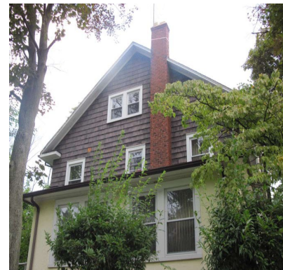
The Legge House - The new home of the Center for Child Advocacy and the New Jersey Child Welfare Training Partnership.