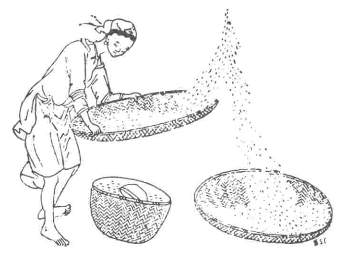
Fig. 35. - Người sáy thóc lúa bằng nia.