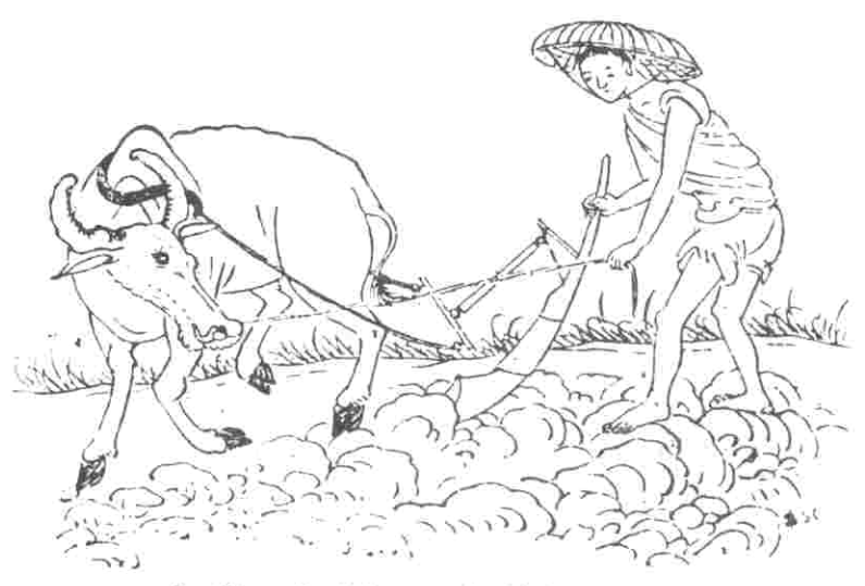
Fig. 28. - (D.) Laboureur. Ngườn đang cây rướng.

Fall should have been aware of the very high proportion of the landowners who did not own enough land to support their families, for he mentioned in the same study the