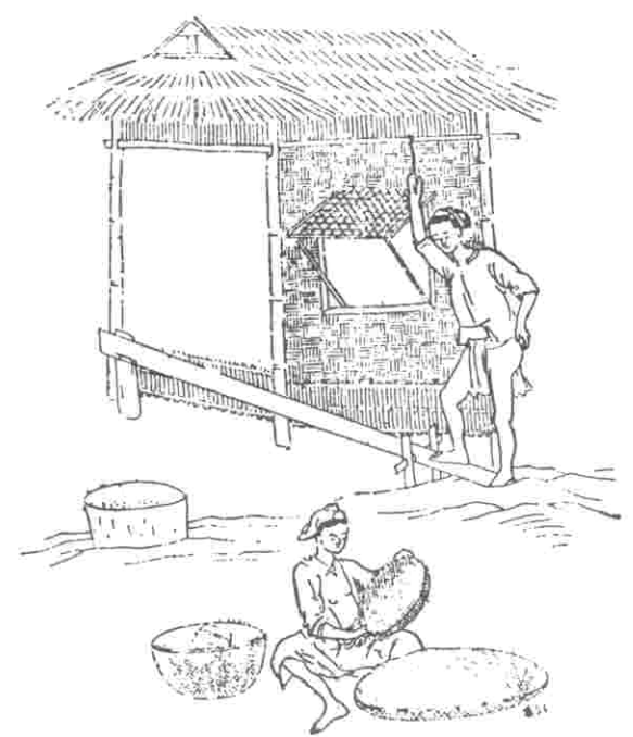
F16. 37. — (D.) Blanchissage du riz. Người giả gao và người giản gao.