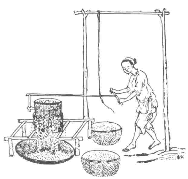
Fig. 36. - (D.) Décorticage du paddy. Xay lúa.