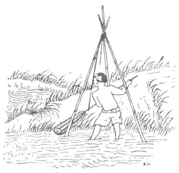
Fig. 32. - (D.) Écope à trépied. Người tát nước gầu sông.

In his attempt to find party documents showing