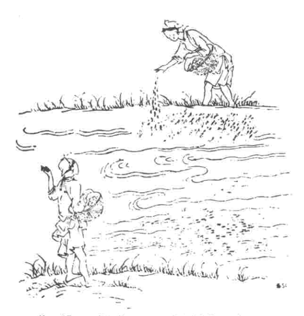
Fig. 27. - (D.) Semeuses. Dan bà đang gien ma.

The reasons for the failure of these partial reforms were both political and economic. With the emphasis during the