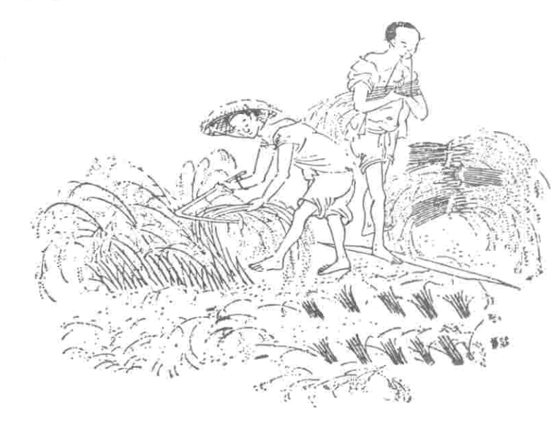
Fig. 33. - (D.) Moissonneurs. The gắt, người gắt lúa.

A determined propaganda attack against the land reform program launched by the South Vietnamese government, with