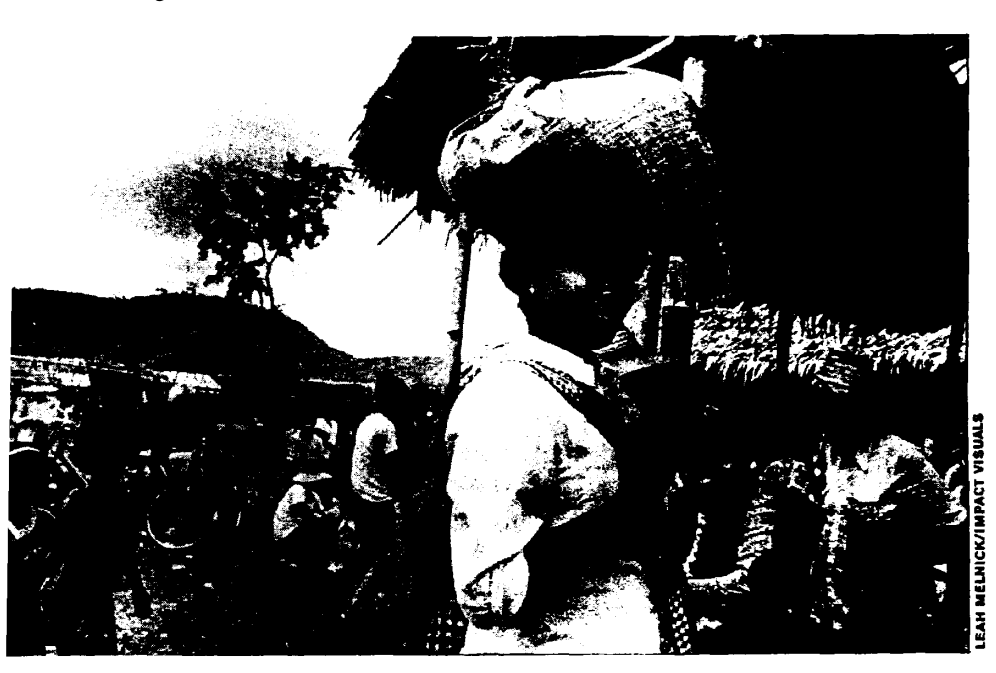
Some of Cambodia's refugees at a UN-run camp controlled by the KPNLF.