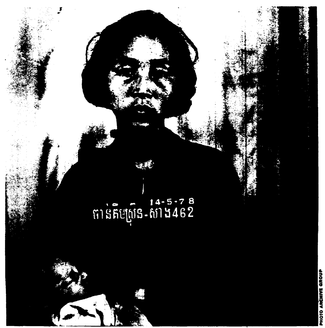
The Khmer Rouge diligently documented its victims such as these, who were presumably executed soon after they were photographed.