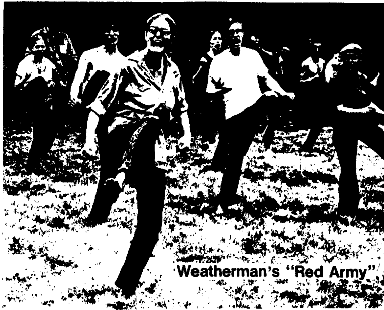
Weatherman's "Red Army"

in a line distributing Chicago leaflets and carrying a red flag.' After planting the flag, the 'R'YMers told the people 'that it's a political world and that they have to deal with that. The main contradiction is between those who have it (auto workers?) and those who don't -- between white America and the colored nations.' People on the beach, seeing a bunch of dangerous nuts, attacked the 'R'YMers. But 'R'YM was heroic. They 'fought the attackers (the people!) to a standstill and left the beach chanting.' As the excerpt below from 'R'YM's paper notes, they're studying karate. Why such half-way measures?